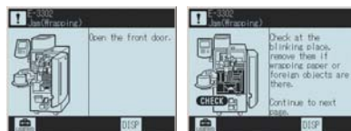
▲ Illustrated operation guidance display