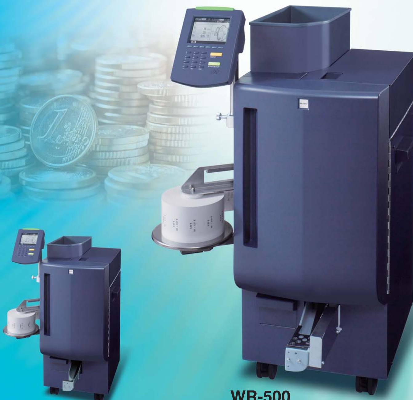
WR-90 Standard model