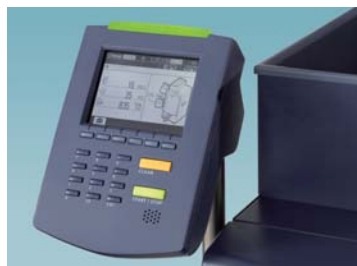
▲ Separated LCD control panel

With utilization of built on LCD control panel, screen visibility and operability were improved dramatically. The processing mode and data contents may be checked quickly and easily. Furthermore, easy-to-understand illustrated operation guide provides accurate and applicable support.